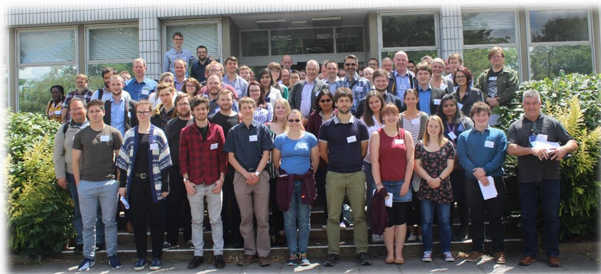
2018 NMR Discussion Group Postgraduate Meeting participants